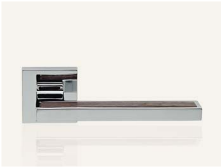
CR cromo lucido polished chrome