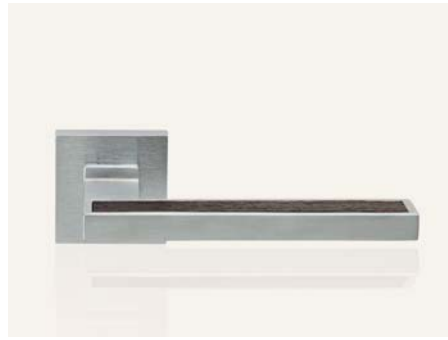
CS cromo satinato satin chrome