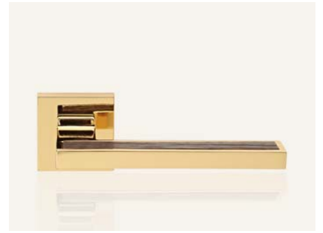
OZ oro zecchino gold plated