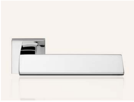
CR cromo lucido polished chrome