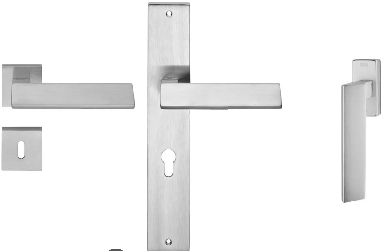
COD. 1360 RB 019