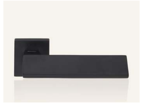
VE nero opaco matt black