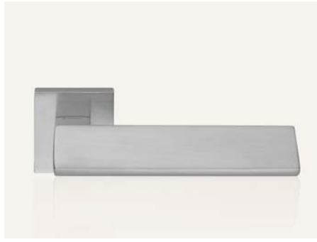
CS cromo satinato satin chrome