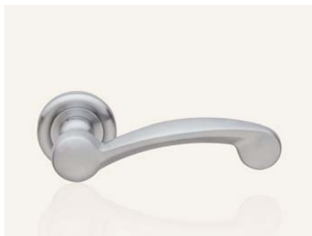
CS cromo satinato satin chrome