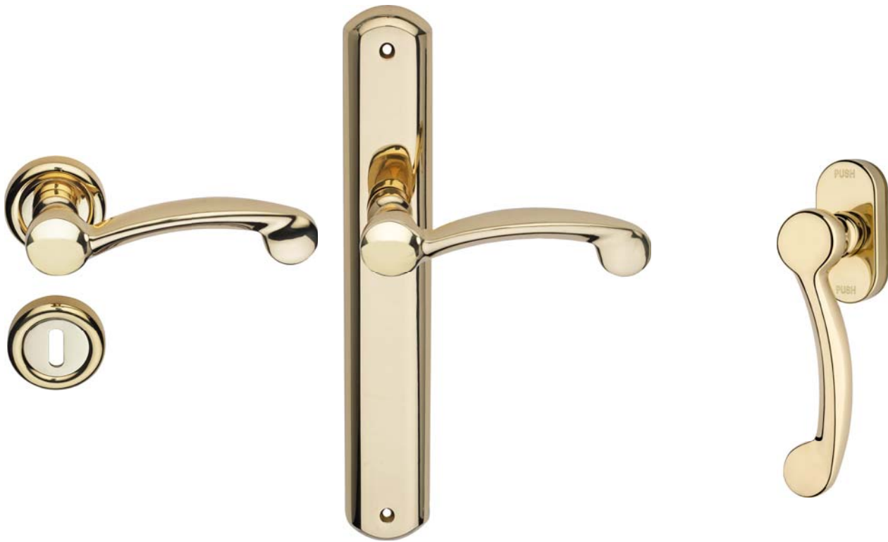
COD. 1330 RB 103