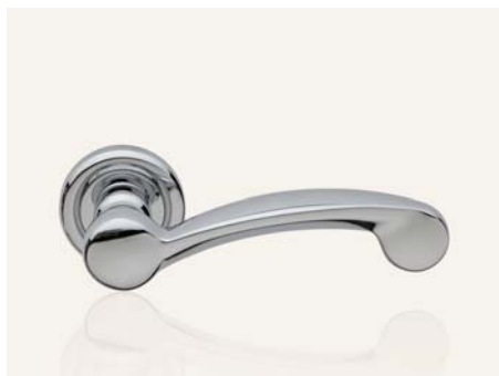
CR cromo lucido polished chrome