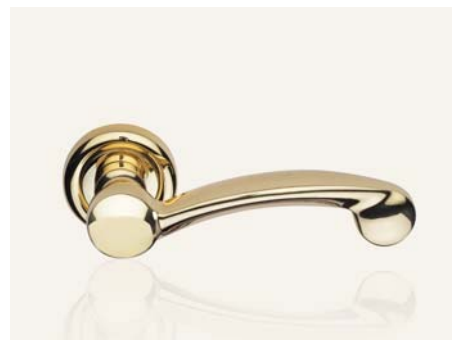
OL ottone lucido verniciato polished brass