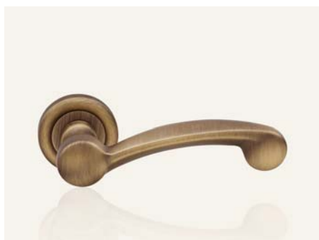
PM patiné patiné mat