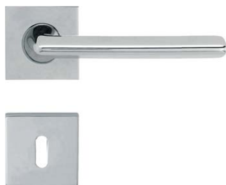
COD. 980 RB 019