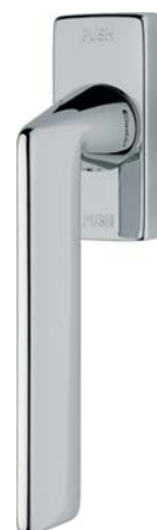
COD. 980 SK