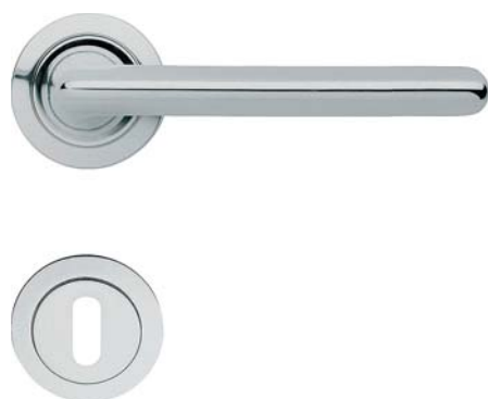
COD. 980 RB 102