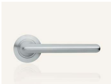
CS cromo satinato satin chrome