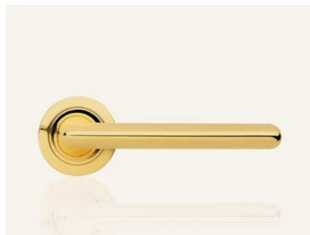
OL ottone lucido verniciato polished brass