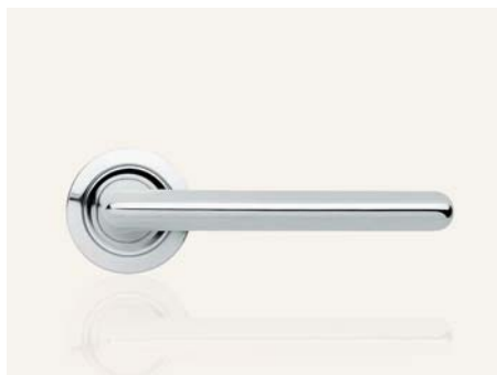
CR cromo lucido polished chrome