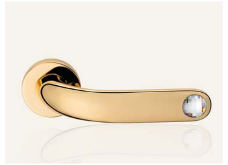
OZ oro zecchino gold plated